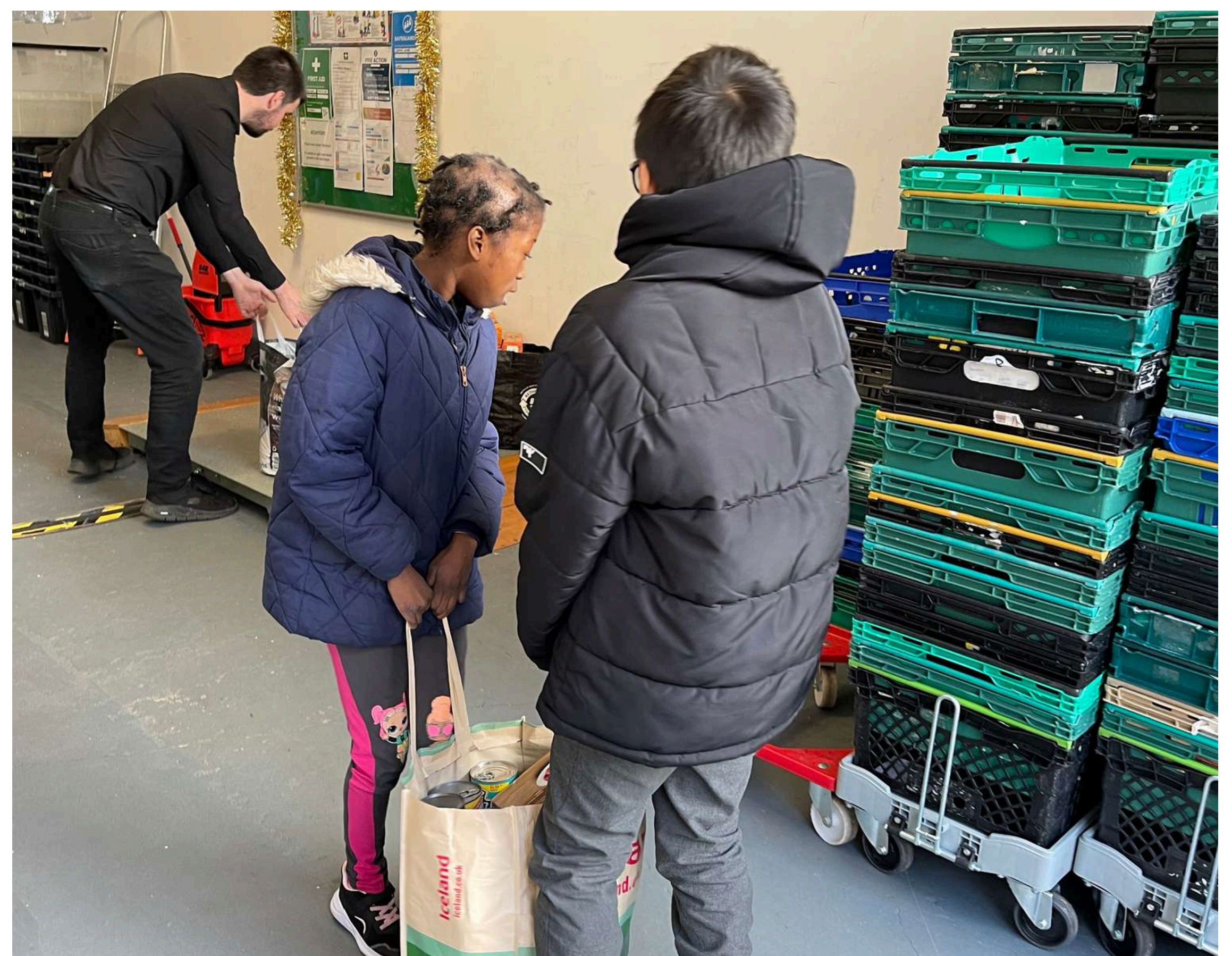
Our young school council leaders in community partnership with local food banks, delivering over 200kg of donations from our very generous Manor school families. Preparing our students to be charitable citizens beyond life at our school.